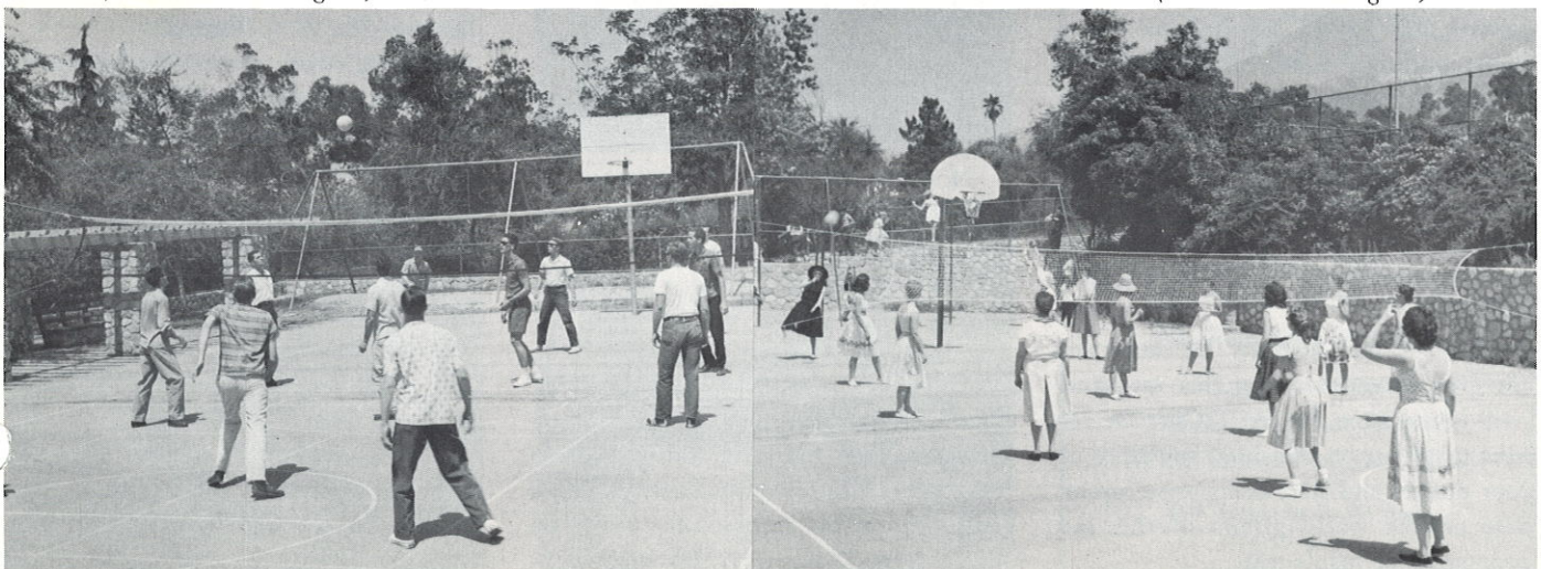
Both the men and the women enjoyed vigorous volleyball at the second Pasadena Church Picnic.