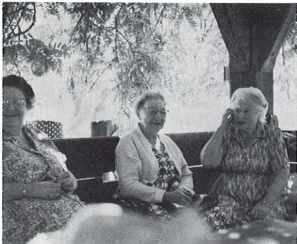
Some folks just like to sit in the shade.

By two p.m. when that much-sought-after food was served, everyone had participated in the game or walk of their choice . . . chess to Chinese